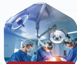
Day care Surgery