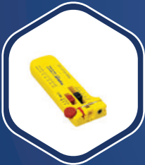
Fiber Stripper Cum Cutter