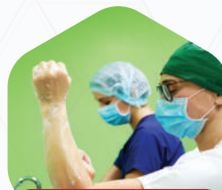
Reduced Risk of Infection