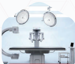
Reduced OT Time