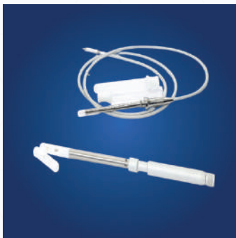
Gynecology Kit (LVR+SUI)